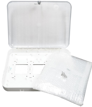
Open with included hardware