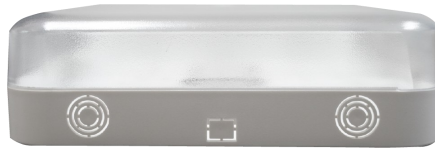
Side View closed with Knockouts