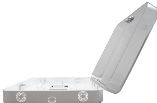
Side View open with Knockouts