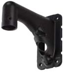
WV-QWL501-B Mount Bracket