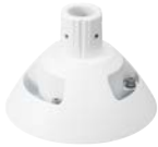
WV-QSR504-W Mount Bracket