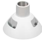
WV-QSR504F1-W Mount Bracket