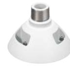
WV-QSR504M1-W Mount Bracket