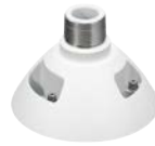
WV-QSR504M-W Mount Bracket